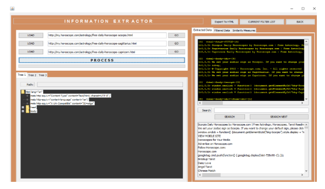
Figure Information Extractor